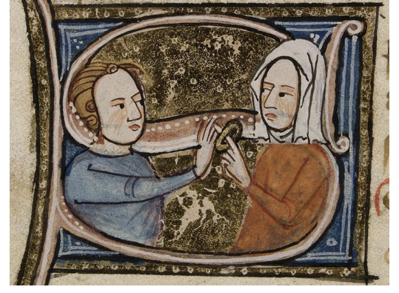
This 14th century image shows a man placing a wedding ring on the finger of his bride.

As the church gained greater control over the marriage ceremony it became common to exchange vows in front of the church. The husband then placed a ring on the right hand of his wife, and sometimes there was a mutual exchange of rings. Mass and a blessing followed in the church and thereafter the marriage was celebrated publically with a feast. The following morning, to mark the consummation of the marriage, the groom gave his bride a 'morning gift'.