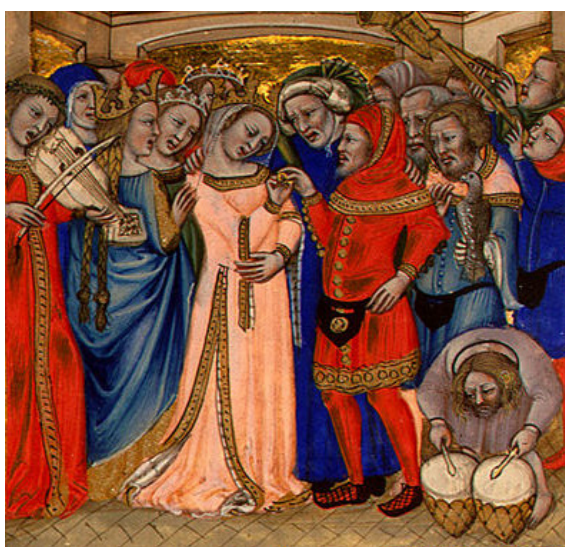
An illustration of a medieval couple marrying from 1350.

According to Canon Law the age of consent was twelve for a female and fourteen for a male. Yet, most folk married later than this. Laws of consanguinity (blood ties) and affinity (non-blood ties) restricted the pool of eligible spouses. For example, from 1215 the church forbade marriage within four degrees which meant a couple who shared the same great-great-grandparent (or any relation closer) could not marry unless they secured special dispensation. Ties of affinity extended these rules to relatives through marriage as well as to godparents. To prevent illegitimate unions it was common to read the banns three times before the wedding day so that any illicit ties could be made known. Providing all was well the marriage went ahead.