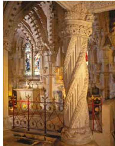
See the famous Apprentice Pillar