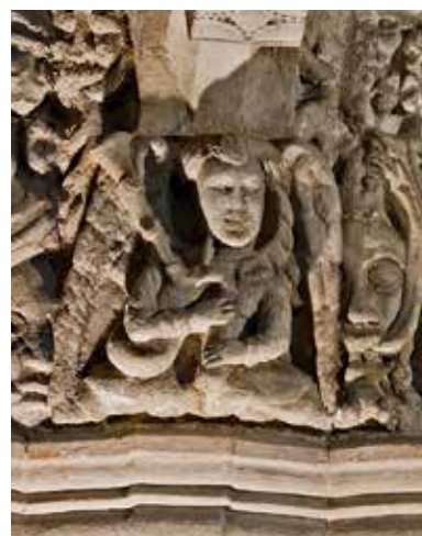
Spot the carving of the Angel playing bagpipes