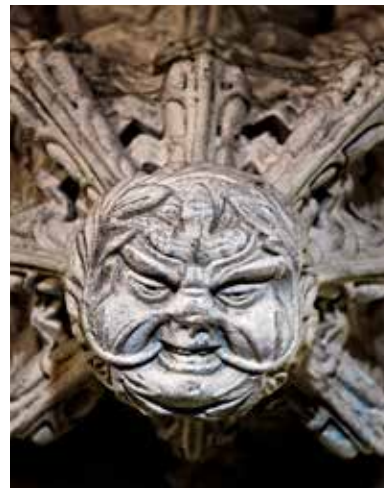
Look for over 100 Green Men carvings