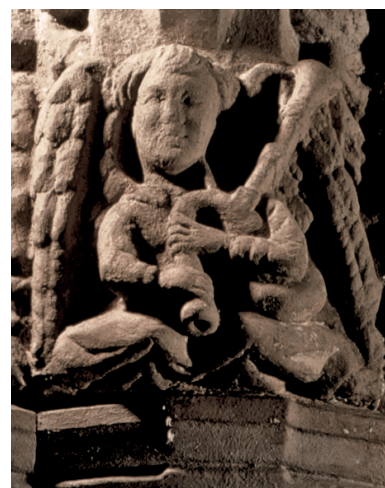
Spot the carving of the Angel playing bagpipes