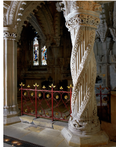
See the famous Apprentice Pillar