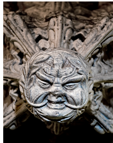
Look for over 100 Green Men carvings