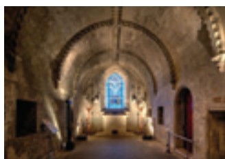
The crypt is the oldest part of the Chapel