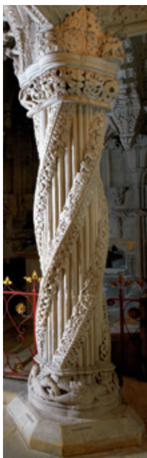
See the famous Apprentice Pillar