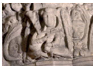
Spot the carving of the Angel playing bagpipes