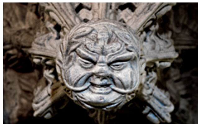
Look for over 100 Green Men carvings

Our souvenir guides, which are available in Dutch, French, German, Italian, Polish, Portuguese, Russian, Slovak, Spanish, Swedish, Japanese and Mandarin, provide a wealth of information and are available to purchase in our shop. They can also be ordered in advance so that your group members have them before their arrival.