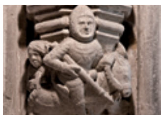
This knight could be William 'the Seemly' St Clair

Rosslyn has survived turbulent times and has recently completed an extensive programme of conservation to ensure its long-term future. The visitor centre, opened in 2012, tells the Chapel's story – from its 15th century origins, through the Reformation, to The Da Vinci Code and beyond it.