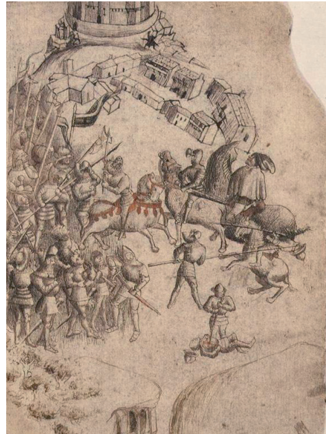
The St Clairs fought on the side of King Robert the Bruce at the Battle of Bannockburn. This illustration dating from the 1440s is the earliest depiction of the battle.

There is a legend that the Knights Templar reached Scotland and were welcomed by the excommunicated Robert the Bruce. That legend also says that the Templars helped Robert the Bruce win the Battle of Bannockburn, and that the King was so grateful for this, that lands and titles were awarded to the Templars. If you believe that story, then it is not a great leap to suggest that the St Clairs must have been involved with the Templars in some way, given their loyalty and close relationship to the King. Like many of the stories surrounding the Knights Templar, however, there is no evidence at all connecting the Templars to Bannockburn and Robert the Bruce.