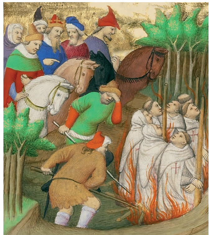
The burning of Knights Templar in the presence of Philip the Fair and his courtiers, from 1413-15.

In France, many Templar Knights were tortured for confessions of heresy, and put to death. Finally, in 1314, the Templar Grand Master, Jacques de Molay, was burned at the stake. The surviving members of the Order went into hiding or merged with other orders.